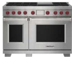
Any size range, wall oven, or cooktop*