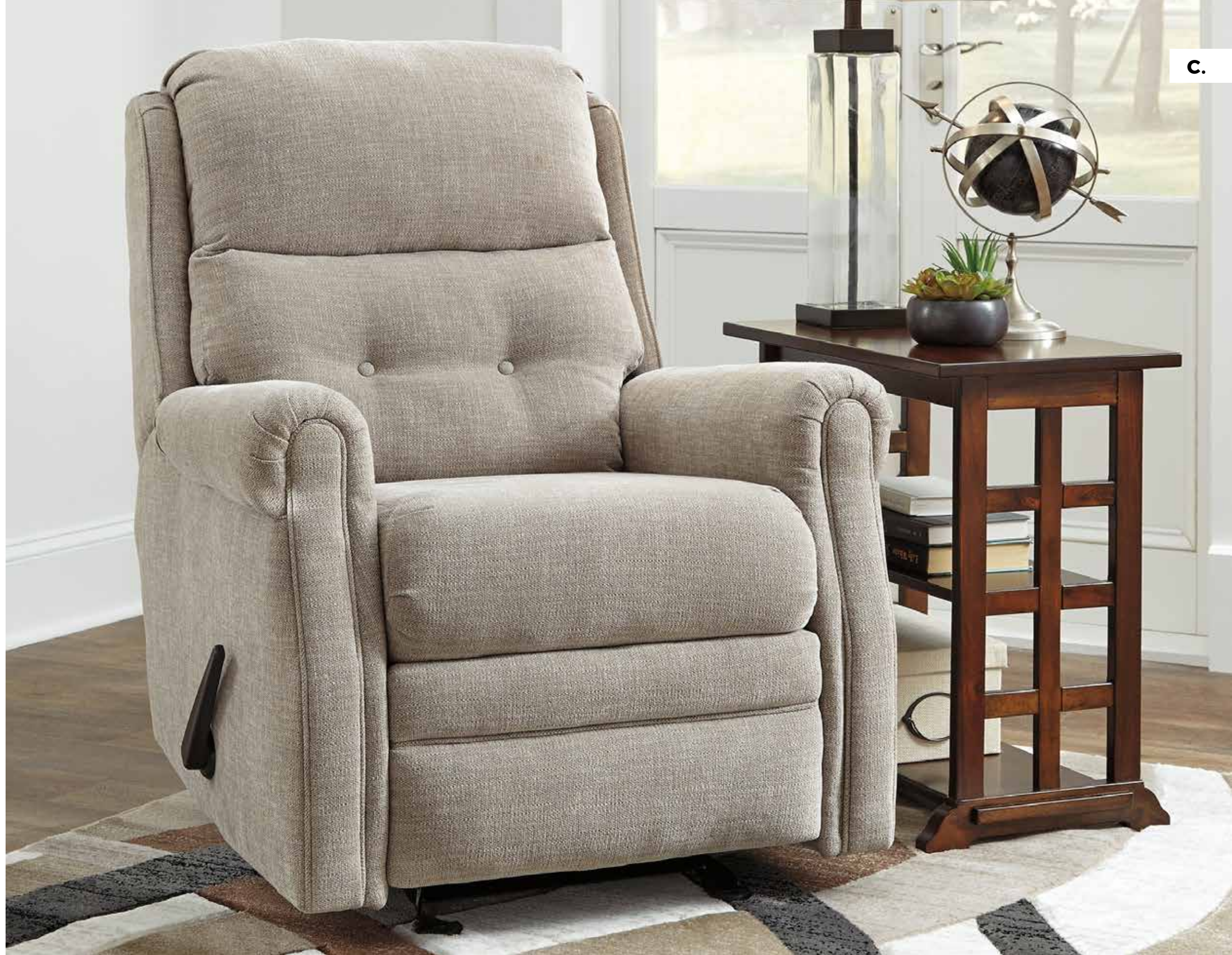
A. PENZBERG BURGUNDY | 5710727