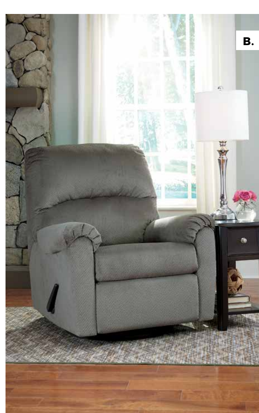
A. BRONWYN COCOA | 2600161