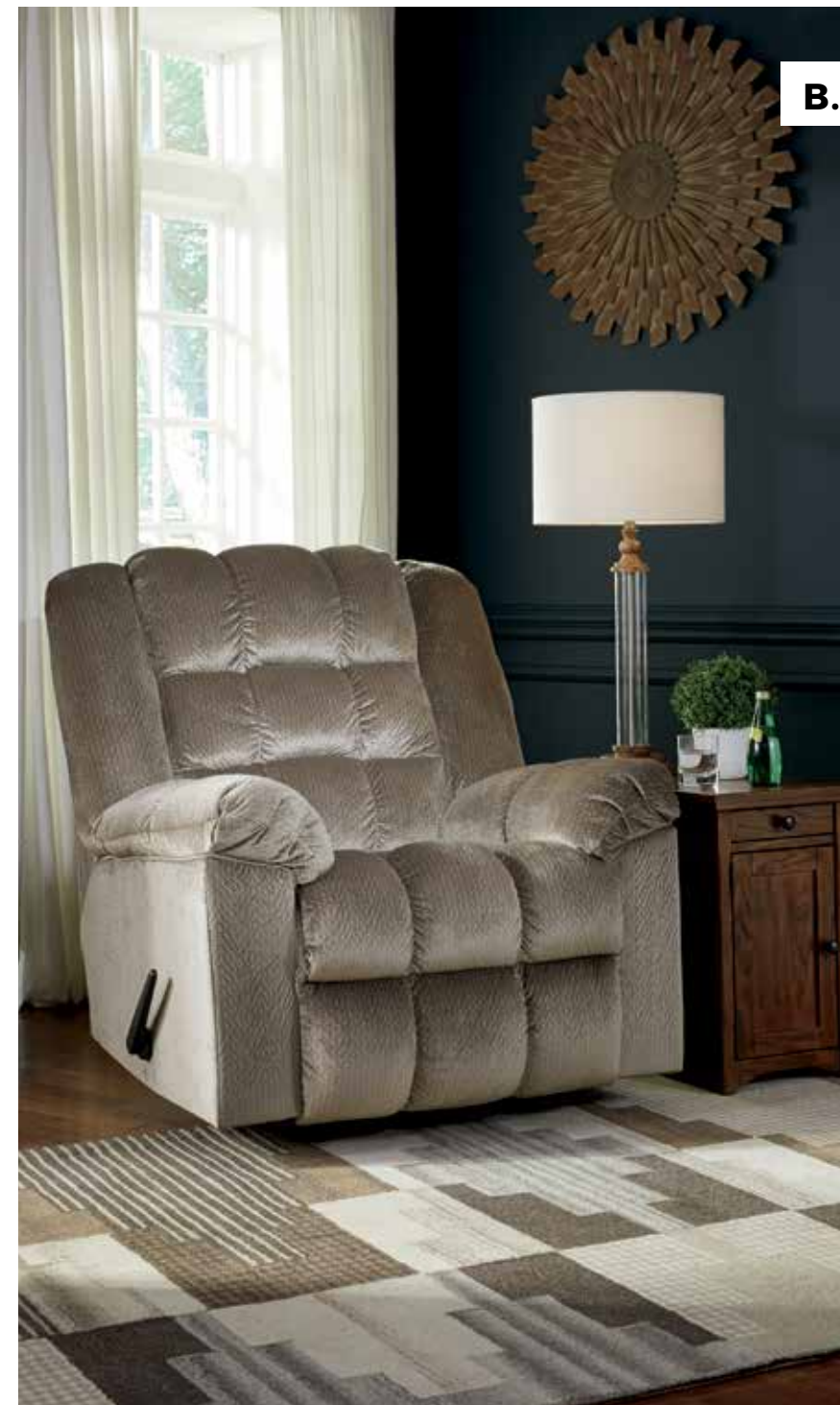
A. MINTURN COCOA | 3710425