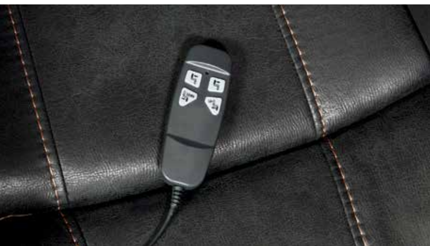
A. YANDEL BLACK | 1090112 B. YANDEL SADDLE | 1090012

One-touch (hand control) power button with adjustable positions with dual motors control the footrest and back independently for custom comfort positioning.