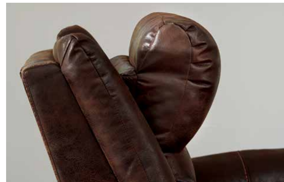
A. BARLING MUSHROOM | 6880313